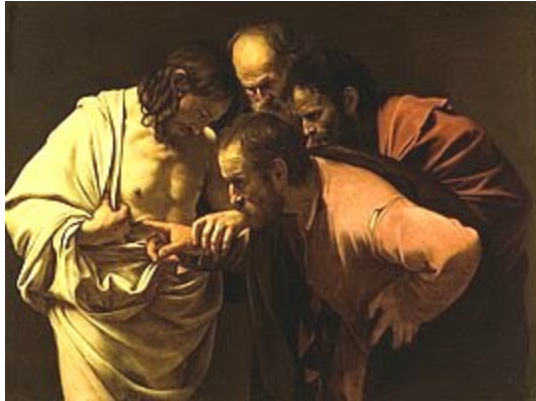
The Incredulity of Thomas by Caravaggio c1602

Christ Episcopal Church Day School cecds.org 410.643.8248